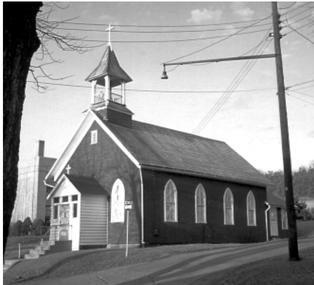
St. Patrick Church at its second location, Hill and First, Mineral City.