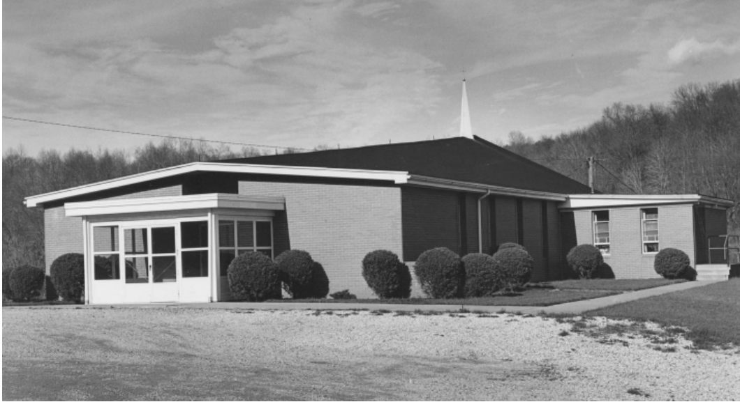
St. Patrick Church at its third location, built in 1969.